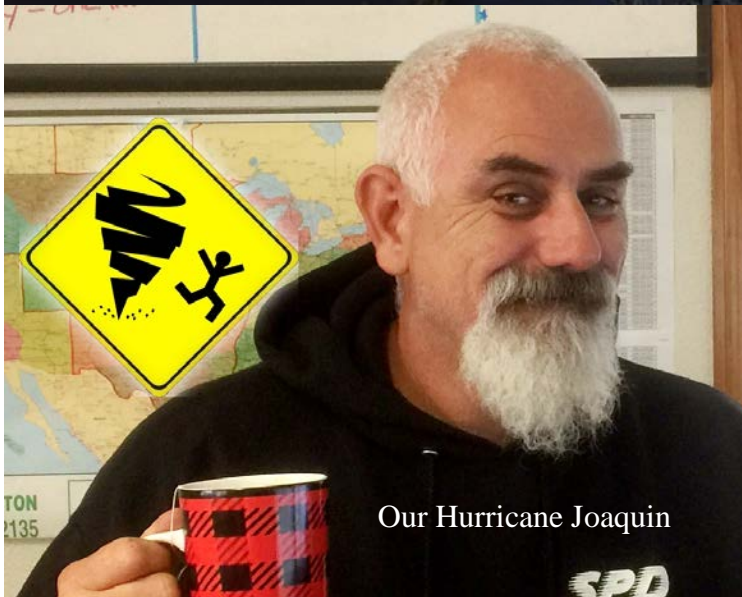
Our Hurricane Joaquin