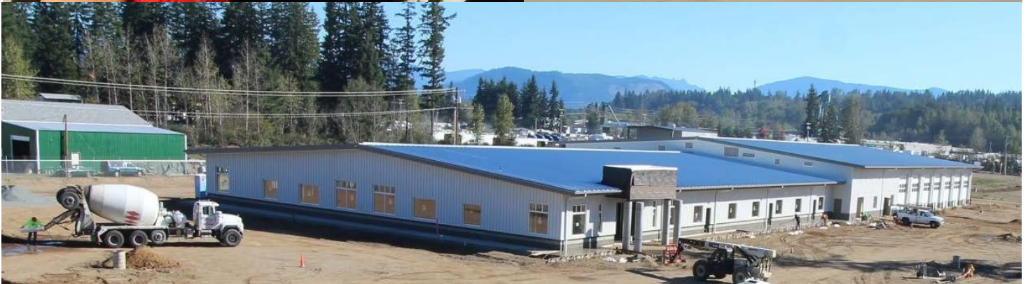
Latest shot of the construction taking place at the new building.