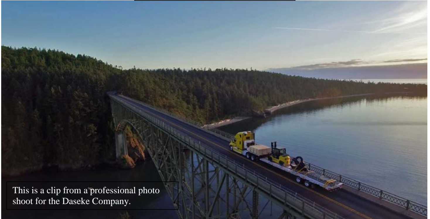
This is a clip from a professional photo shoot for the Daseke Company.