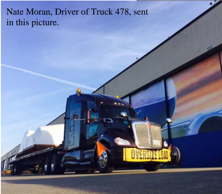
Nate Moran, Driver of Truck 478, sent in this picture.