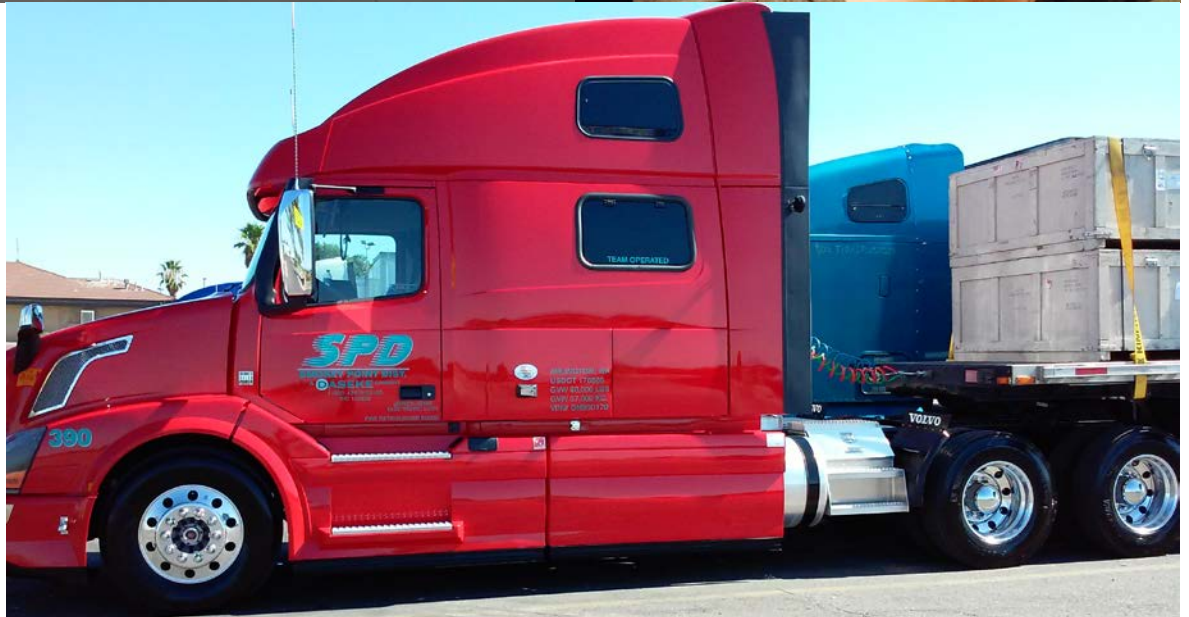
Jeannette Hall sent in a picture of 390 – "Here is our stunning truck 390 after being washed, waxed, hand dried, and tire treatment. It's worth the extra money to take pride in my truck and company!!! "